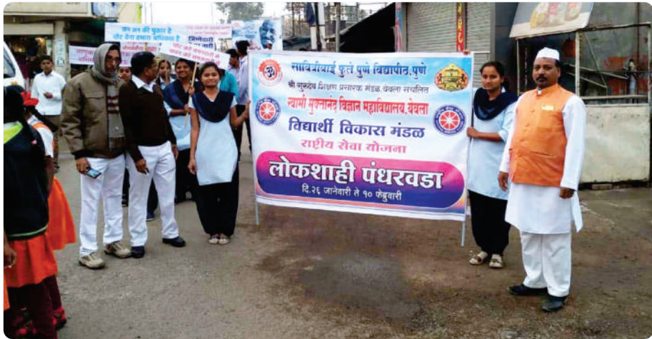
विद्यार्थी विकास मंडळ, लोकशाही पंधरवडा रॅली