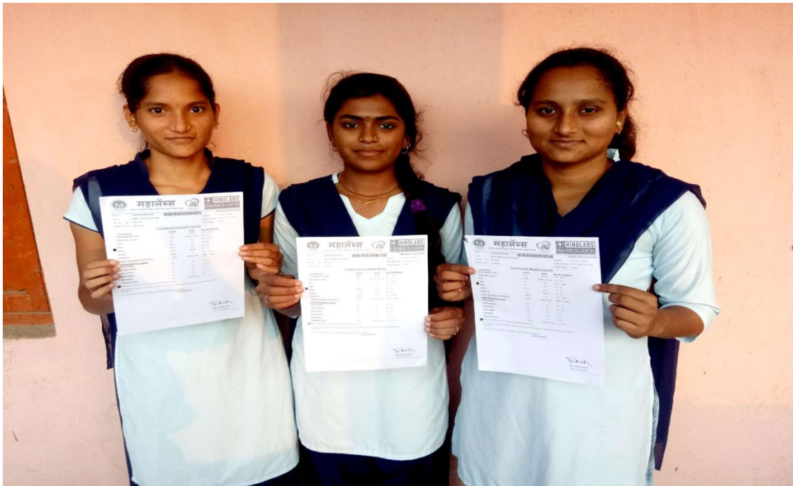
Girls With Complete Blood Count Report given By Mahalab