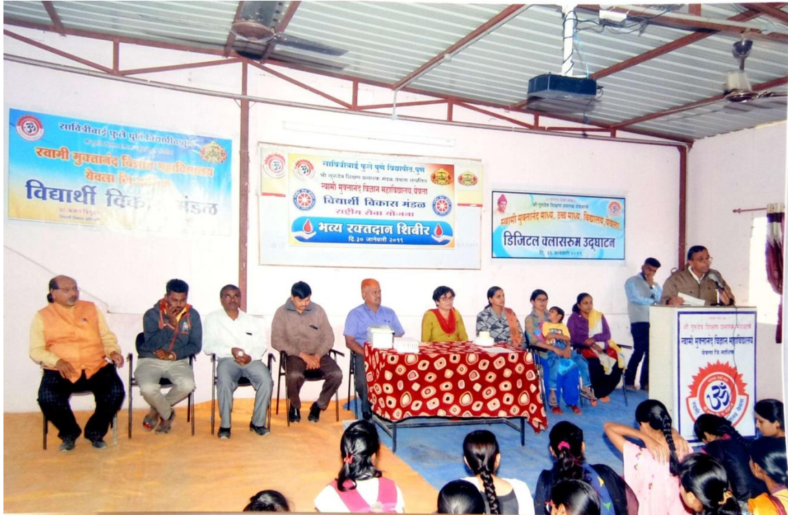
Welcome of team of the Rural Hospital ,Yeola By Pro. P.N. Patil, on the occasion of Complete Blood Count & Blood Donation Camp