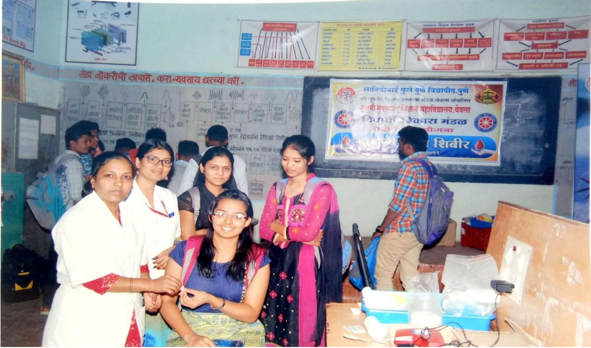
Collection Blood Samples for Complete Blood Count